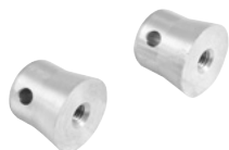
No. 60301591 ALUTRUSS DECOLOCK Halfconical Adapter Set DQ2 M8