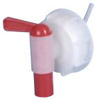
No. 51704245 ..... Tap for 25 and 30l tank