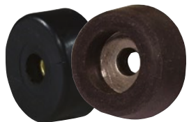
No. 30001200 .....large, steel-reinforced No. 30001202 ..... 25 x 25 mm No. 3000130A .....small, with steel ring ROADINGER Rubber foot • With steel disk insert • Diameter: 38 mm • Height: 20 mm • Weight: approx. 30 g • Mounting hole: d= 5.5 mm