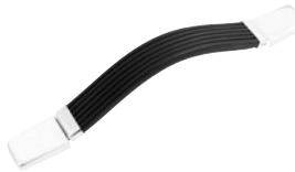
No. 30001100 ROADINGER Strap handle with steel fixation • Black plastic with steel core • Fixation steel with nickel-plated caps • Total length approx. 290 mm • Weight approx. 110 g • Mounting holes: d=5.0 mm