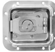
No. 30000625 ROADINGER Overlatch 115x127+44