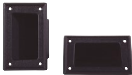
No. 30000830 ROADINGER Insert dish handle, black plastic • Cut-out 50 x 95 mm • Weight approx. 40 g • Mounting holes: d=5.0 mm