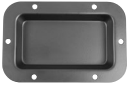
No. 30000193 ROADINGER Inlet dish, black