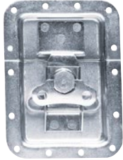
No. 30000400 .....large in dish No. 30000600 .....small in dish ROADINGER Butterfly lock • Material: steel, zinc-plated • Weight: approx. 460/180 g • Mounting holes: d=5.1 mm