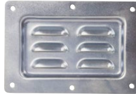
No. 30000197 ROADINGER Inlet dish, ventilation • 1 mm steel, zinc-plated • Weight: approx. 160 g • Cut-out: 126 x 74 mm • Mounting holes: d=5.1 mm