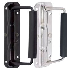
No. 30000980.....silver No. 30000981.....black ROADINGER Surface mounted handle sprung • Sprung handle with snap back mechanism • With black PVC handle • Mounting holes: d=5.0 mm • Without mounting dish