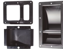
No. 3000070K.....plastic No. 30000800 ..... steel, black ROADINGER Bar handle, MARSHALL • Black plastic