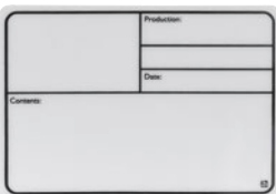
No. 30002150 ROADINGER Label self adhesive 177x127mm