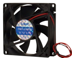
No. 30309250 EUROLITE BF-12 Axial fan 12V 80x80x25mm 45m³/h • Ideal for the installation in already existing systems, e. g. cases, empty housings, etc. • Reliable due to high-quality workmanship • Low noise and easy rotation due to elaborate technology