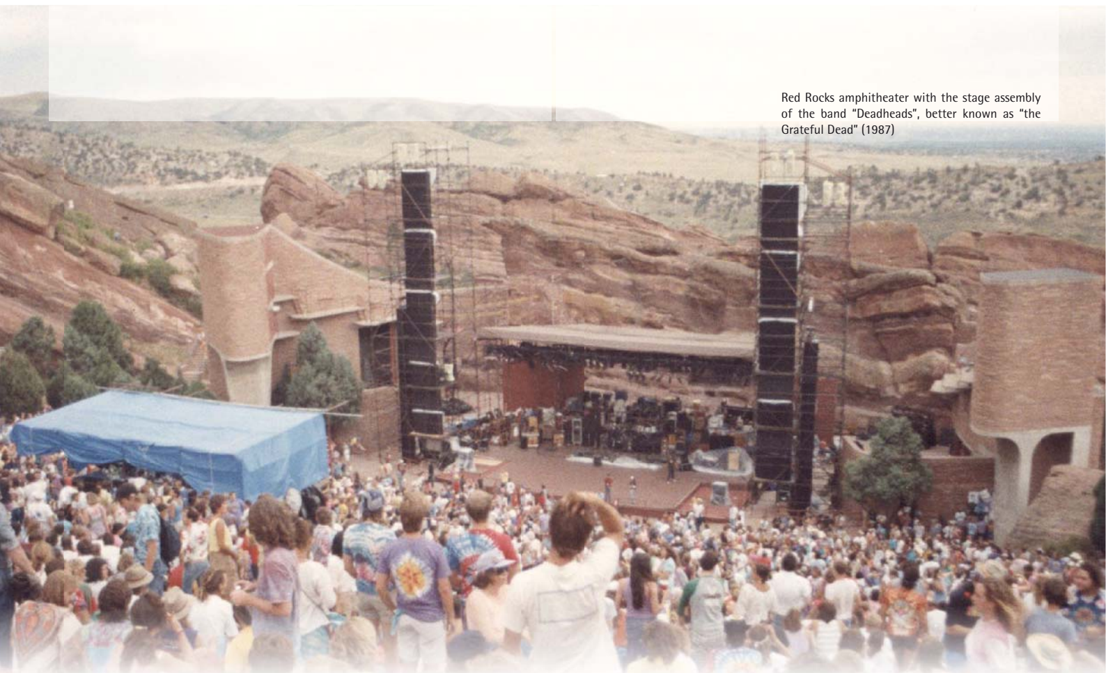
Red Rocks amphitheater with the stage assembly of the band "Deadheads", better known as "the Grateful Dead" (1987)

With the CLA system, PSSO offers a flexible tool for all kinds of different tasks in the sound reinforcement business. The system is an economical line array fulfilling all safety requirements, which can be easily installed and convinces by its sound, according to the slogan „I love Sound!“