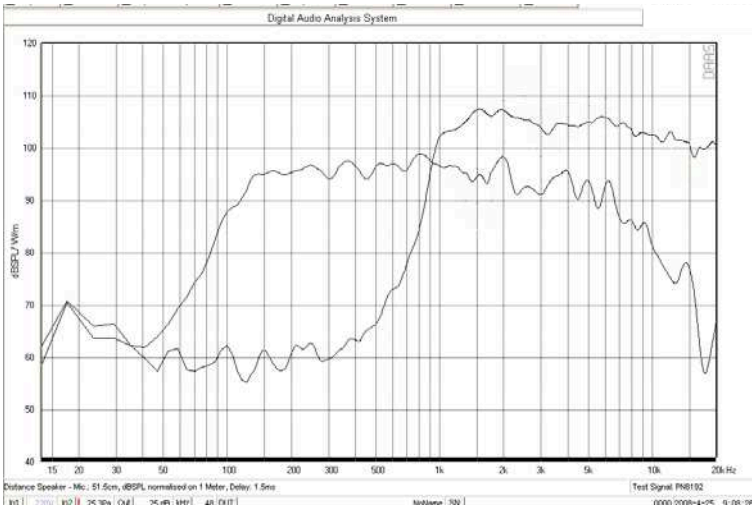
Frequency Response Curve