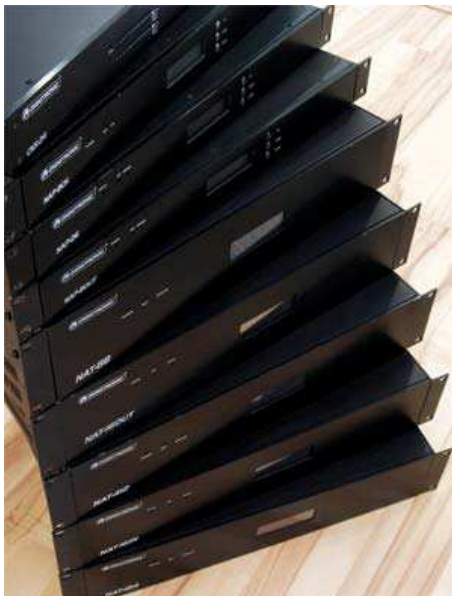
Omnitronic NAT series