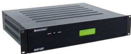
Omnitronic NAT-22 Audio transmitter

Additionally a 24-channel network switch CNS-24 is available, which serves as junction in the CobraNet. Unlike other common switches the ports are at the back, so a rack-mount option is given. Furthermore, it has no fan which is an advantage for audio applications.