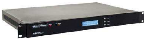
Omnitronic NAP-8OUT Audio processor

Basically, it can be used for that, after all multi-channel live mixers using CobraNet are already available. Depending on the specific application delays are possible, which might be unacceptable for musicians. Recommended are permanent installations in large areas like theaters, casinos etc. See point "What applications CobraNet is made for?"