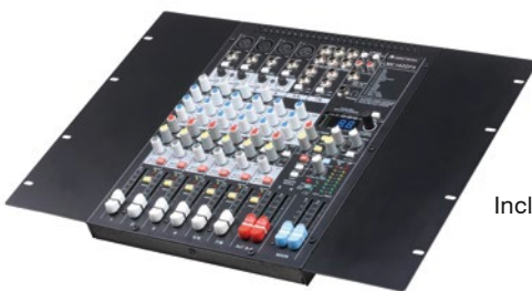
Incl. brackets for rack installation